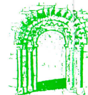
Dysert O'Dea Romanesque Doorway

ACCOMMODATION CAN BE ARRANGED BY PHONING THE ENNIS TOURIST OFFICE AT 65 - 28366