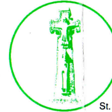
St. Tolas 12c. Cross, Dysert O'Dea

10.30 Musical entertainment and traditional Irish folk dancing.