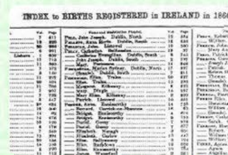
Indexes to the Registers of Civil Records in the General Register Office now available