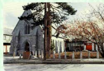
Clare Library - Over 6,600 links added to library website