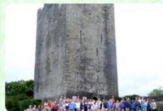
Complete list of the O'Dea Clan Chieftains