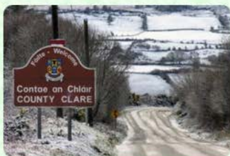
Check-list and Tips for Family Historians Intending to Visit County Clare