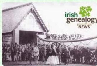
New Irish Genealogy Records 2014