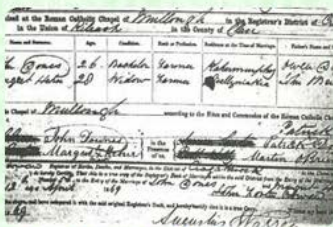
Index of Clippings from County Clare Parish Records